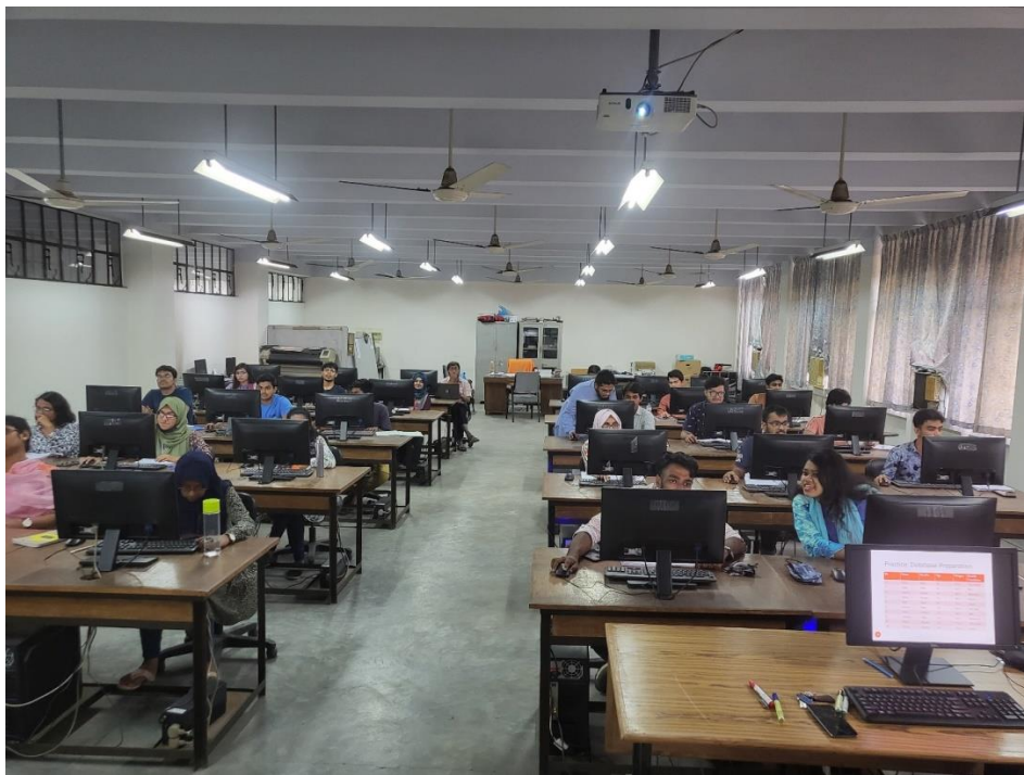
Figure 3: GIS and Remote Sensing Laboratory, URP 403