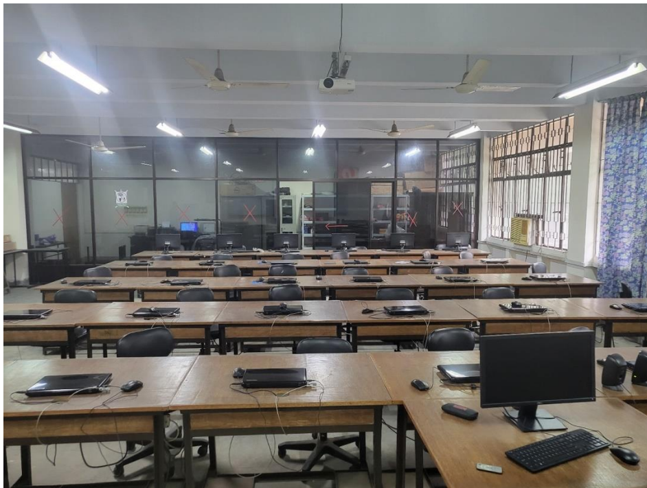
Figure 1: Computer and Data Analysis Laboratory, URP 208