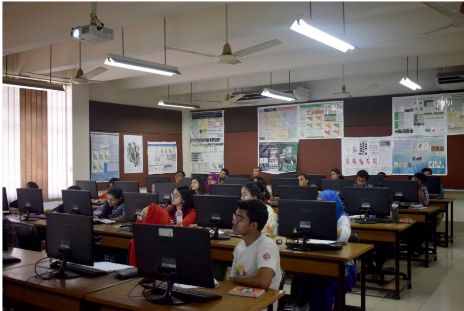
Figure 2: Simulation Laboratory, URP 402